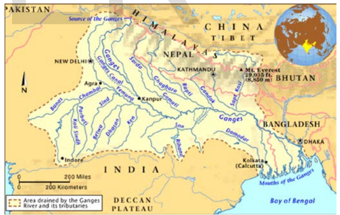
Fig 1.2 Ganga Basin

The river Ganga and its numerous tributaries, of which important ones are the Yamuna, the Sone, the Ghaghra, the Gandak, the Kosi and the Mahananda, constitute this river region. It covers ten states of Uttaranchal, Uttar Pradesh in its basin area, Jharkand, Bihar, South and Central parts of West Bengal, parts of Haryana, Himachal Pradesh, Rajasthan, Madhya Pradesh and Delhi. The normal annual rainfall in this region varies from 60 cm to 190 cm of which more than 80% occurs during the south west monsoon. The rainfall increases from West to East and from South to North. The flood problem is mostly confined to the areas on the northern bank of the river Ganga. The damage is caused by the northern tributaries of the Ganga by spilling over their banks and changing their courses. Even though the Ganga is a mighty river carrying huge discharges of 57,000 to 85,000 cumec (2 to 3 million cusec), the inundation and erosion problems are confined to relatively few places.