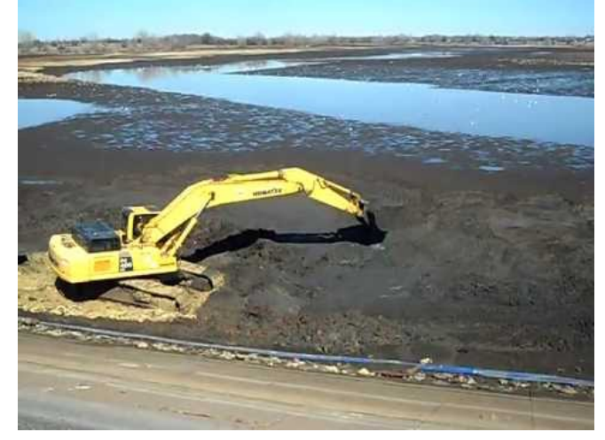
Fig 1.5 Slit removal from River bed

We have created a pictorial view of our idea. There is a sink hole which can be used as a prime parameter for flood management system. The depth of thishole will be around 600 m to 700 m (into the earth surface). As we can see in fig 1.4, water can come into the hole from any direction, hence we have covered this hole by a defensive steel wire net(covering all the sides as well as the top of the hole as cap over a bottle), which is providing safety around the hole. The material used could be similar to the one used in flap gates or in agua fences. The cylindrical net structure prevents the hole from blockage which may happen by the sediments collected during floods. The silt gets deposited and raises the level of river bed which also causes the floods to happen so our model could comprise a technique which will remove the silt automatically using electromechanical techniques, as a real time response.