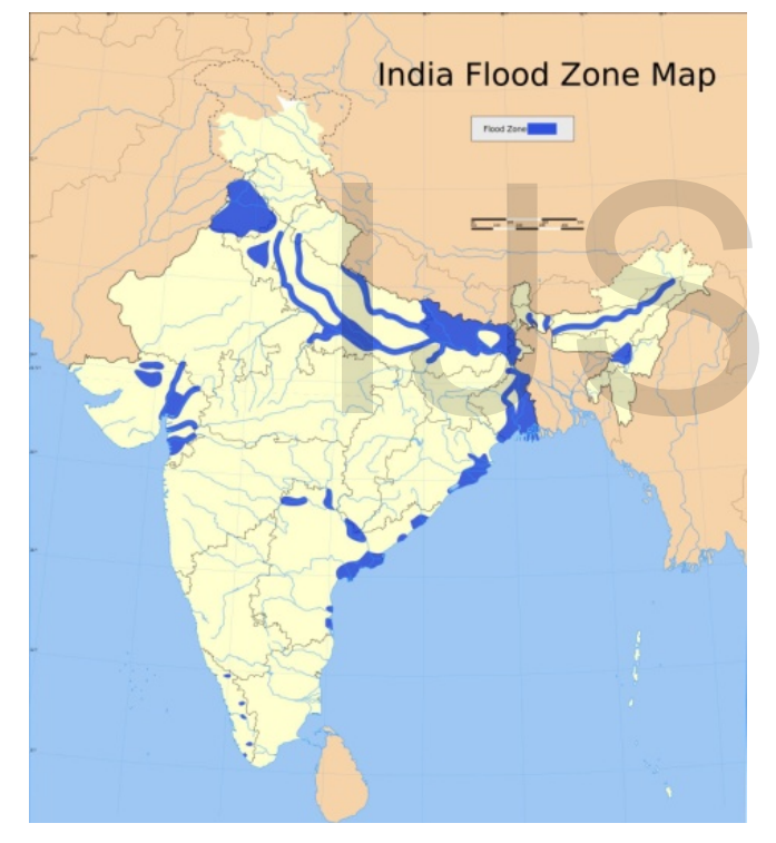
Fig 1.1 India Flood Zone