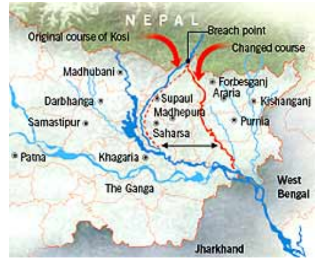
Fig 1.3 Kosi river basin